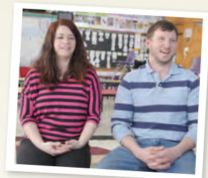
This Mom and Dad are United Way donors who are excited to see their gift in action at their children's school providing kids with healthy snacks and summer learning opportunities.