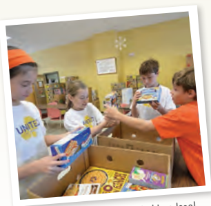
Families sort food to be donated to a local food pantry at Shore Country Day School's United in Service volunteer day coordinated by United Way.