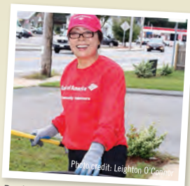
Bank of America employee landscapes at an affordable family apartment building during the NSUW's 9/11 Day of Service.