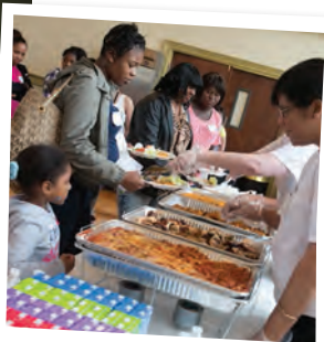
Family Supper Program

Our goal is to help children have greater access to healthy food and physical activity. Our focus is to: