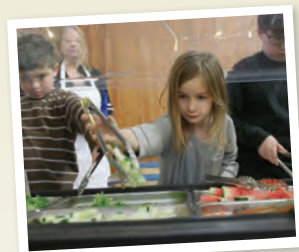
Children enjoy healthy choices at the PowerSnack salad bar at Veterans' Memorial School in Gloucester.