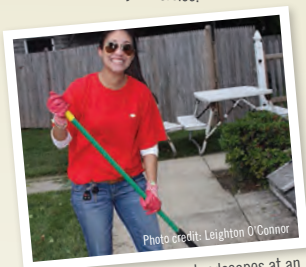
Bank of America employee landscapes at an affordable family apartment building during the NSUW's 9/11 Day of Service.